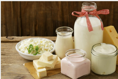
“ Rozaneh Sahadat company dairy products ”