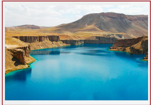
“ Band-e-Amir, Bamyán, Afghanistan ”